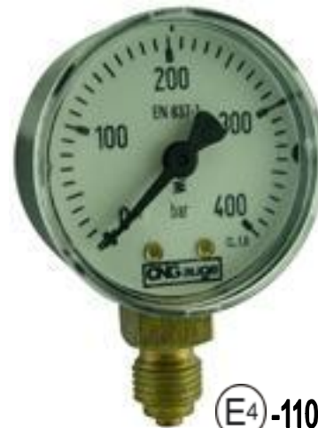
B221A Type (普通压力表)