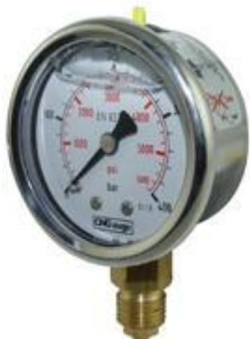
B101A Type (耐震压力表)