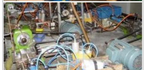
数控车及半自动车床加工车间。 CNC machine and Semiautomatic lathe machine, mainly make real SS316 connections;