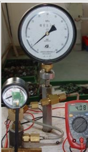
液化石油气汽车专用传感器生产车间，目前主要为国外车商配套。 CNG sensor production, mainly sell to overseas car makers;