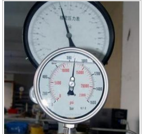
高压压力表的生是我司的一大优势，最高压力可达200MPa。 We are specialized in high pressure ranges, up to 2000bar;