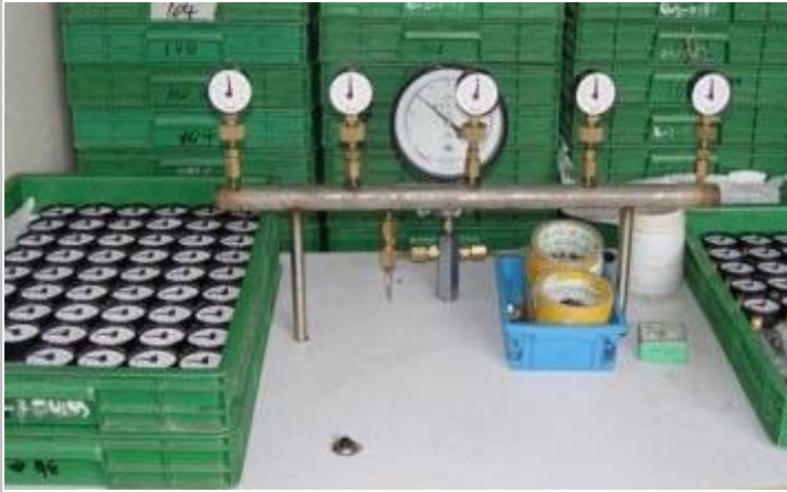
所有产品在装配后均需经过一至二次检验方可包装。 After assembly, all products must be inspected once or twice before packing;

PROTECTED PRODUCTION PICTURE UNAVAILABLE