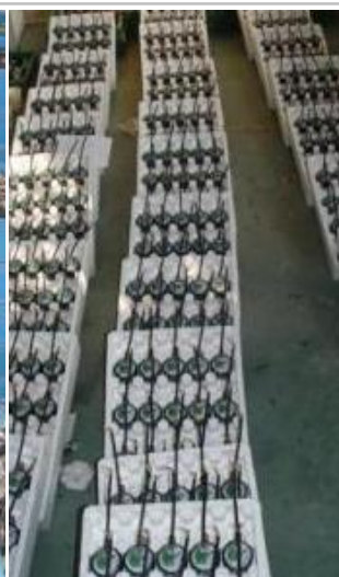
液化石油气汽车专用传感器生产车间，目前主要为国外车商配套。 CNG sensor production, mainly sell to overseas car makers;