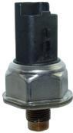
HTS260: Hall Transmitter

CNG Pressure Gauges and Sensors / 压缩天然气车用传感器