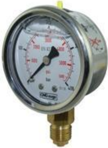
B101A Type (耐震压力表)