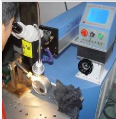
激光焊接设备，将表壳及接头焊在一起。 Laser welding equipment, to weld connection and case together;