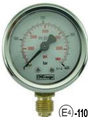
B211A Type (普通压力表)