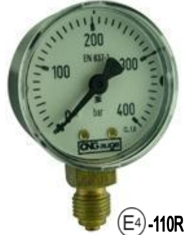
B221A Type (普通压力表)