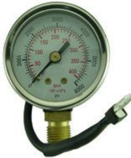
CNG215H: Hall Sensor Gauge